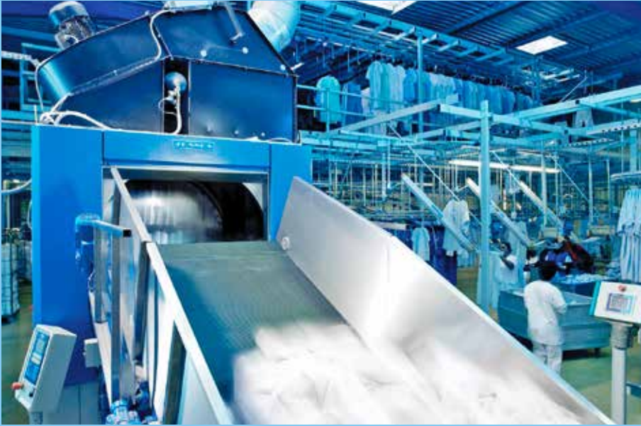
Single dryer with loading belt.