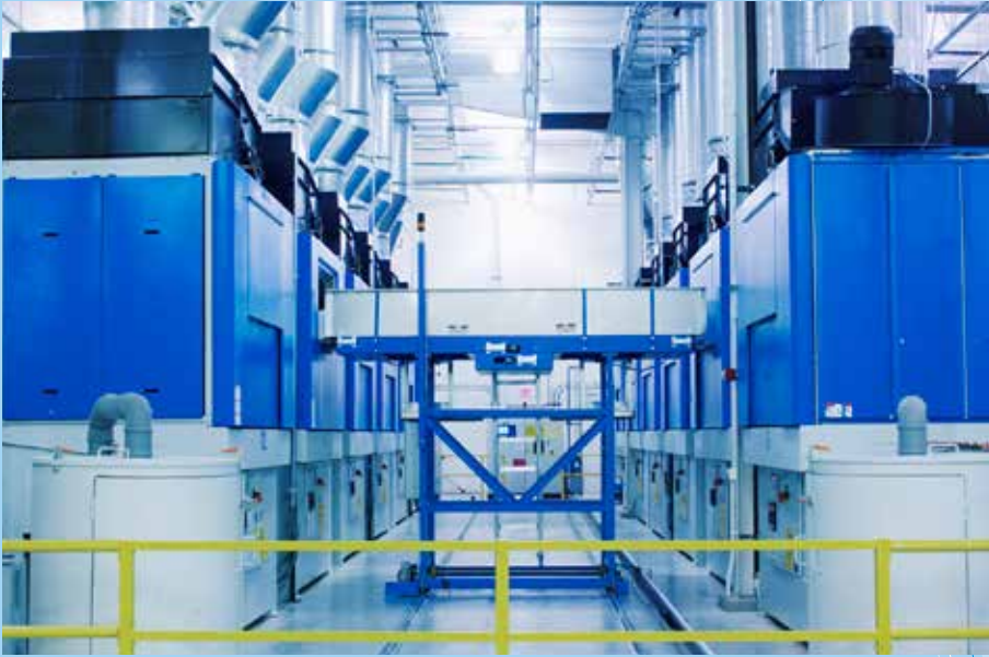
Spacesaving dryer positioning for high production capacity.