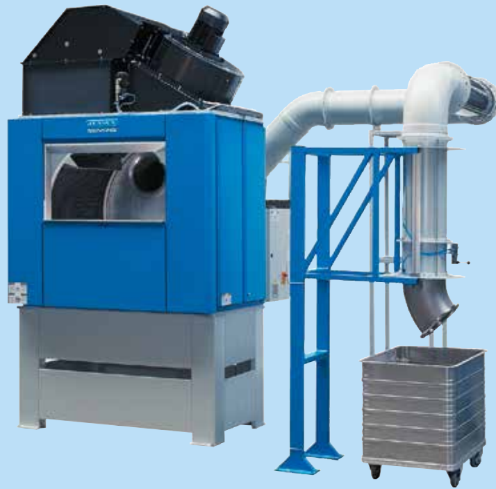
Vacuum loading through the unloading door of the dryer with the VacuTrans system.