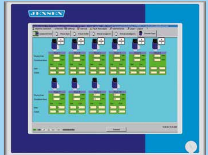
The dryer compound control connects all dryers with each other.